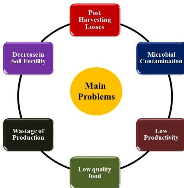
Figure 1 Main Problems in the agriculture field

about the potential risks associated with their manufacturing process and utilisation, as well as their disposal methods and overall negative effects on the health of living things and the environment, are some of the contributing factors [23–24]. In this article, we examined the development of agricultural inputs into nanopesticides using nanotechnology.