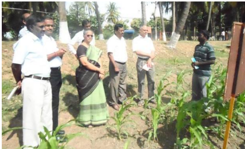
Scientist visit INM of maize in rice-gingelly-maize cropping system through IFS

Harvesting and processing: Two border rows on all four sides of each treatment plot were harvested first and then the net plots harvested separately. The harvested cobs were dried, dehusked, shelled and cleaned separately. After cleaning, the grains were sun dried to 14 per cent moisture content. Grain weight of each treatment was recorded and expressed in kg/ha. Stover yield was also recorded and expressed in kg/ha.