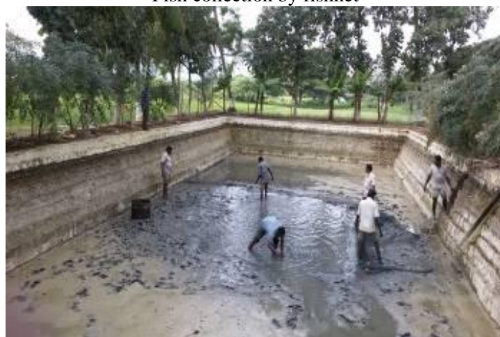
Silt manure ready for next cropping system from IFS