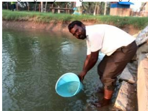
Fingerlings releasing by research scholar