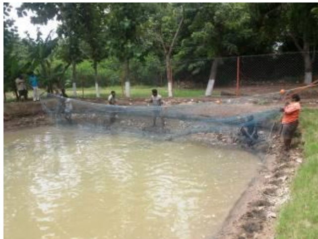
Fish collection by fishnet