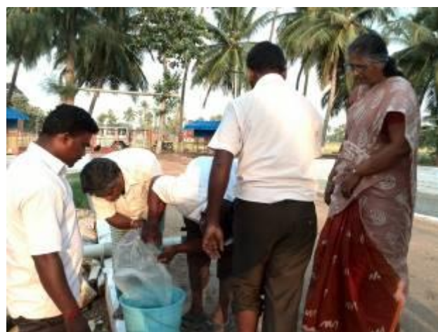
Fingerlings ready for Integrated Farming System