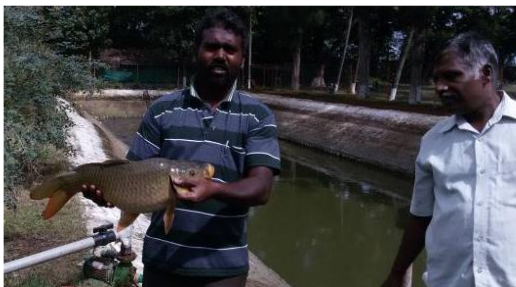
Integrated farming system via a fish weight 3.5 kg/9months