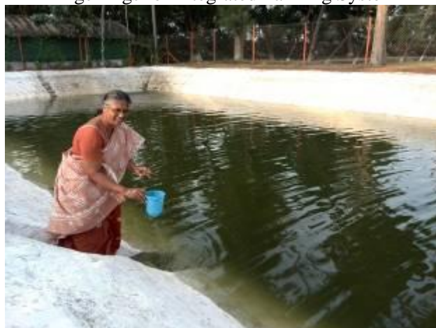
Fingerlings releasing by chairperson