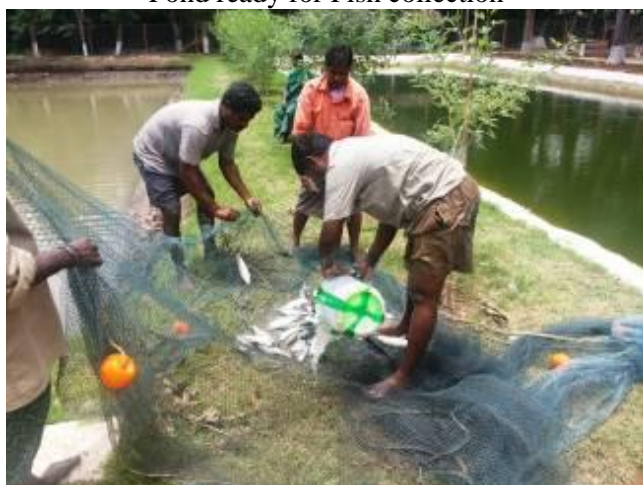
Collection of Fish from IFS pond