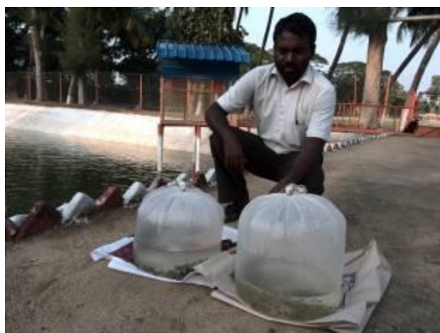
Fingerlings for Integrated Farming System