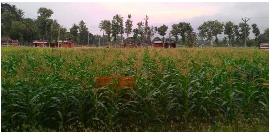
General field view of maize through integrated farming system