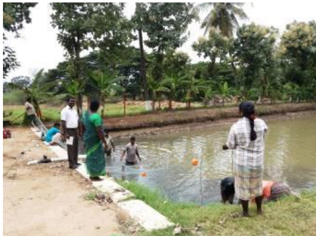
Pond ready for Fish collection

Statistical analysis: The data on various characters studied during the course of investigation were statistically analysed as suggested by Gomez and Gomez (1984). Wherever statistical significance was observed, critical difference (CD) at 0.05 level of probability was worked out for comparison. If there are no significant differences between treatments, it was denoted as 'NS'.