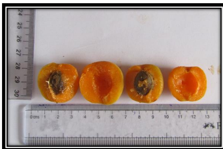
Figure 3 Cross section of Apricot showing the Pulp to Stone Ratio

In the year 2016, the pulp to stone ratio did not show significant variation under different treatments. Fruits from trees treated with CPPU at 5 ppm at petal fall stage (T 3 ) had the maximum pulp to stone ratio (6.53:1) and minimum (5.39:1) in T 6 (100 ppm NATCA at pink bud).