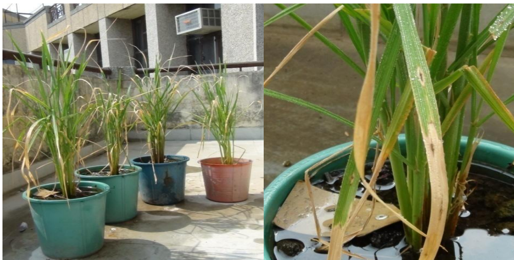
Figure 2 Demonstration of Koch's postulates Pathogenicity test of Blast pathogen ( Pyricularia oryzae )

fungus was tested according to Koch's Postulates. Pot experiment was carried out to determine the pathogenic capabilities of fungus Pyricularia oryzae . Four Pots (30 cm diameter) filled with approximately 3.5 kg sterilized soil (Autoclaved at 115 psi/cm 2 pressure for ½ hr.). Then inoculums of Pyricularia oryzae was prepared by growing on potato dextrose agar medium, in 250 ml conical flasks autoclaved at 15 psi for 20 minutes. Each flask inoculated with pure culture of rice blast ( Pyricularia oryzae ) and incubated at 25± 2°C for 10 days. The leaves were then inoculated by spraying with conidial suspension of the pathogen @ 2×10 4 conidia per ml concentration. After inoculation of Pyricularia oryzae in potted plants of rice were covered with polythene bags for 48 hours to provide humidity and to prevent them from secondary infection. Controls were also maintained that received only sterilized water spray. Plants were watered periodically to maintain the requisite moisture for proper growth and development of the disease symptoms. The development of the disease symptoms was regularly observed and recorded. Re-isolation of Pyricularia oryzae from the affected plants part after symptoms were made in order to confirmed the presence of inoculated fungus to prove the Koch postulates.