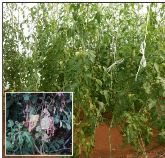
(B) Udaipur (Narayanpura)