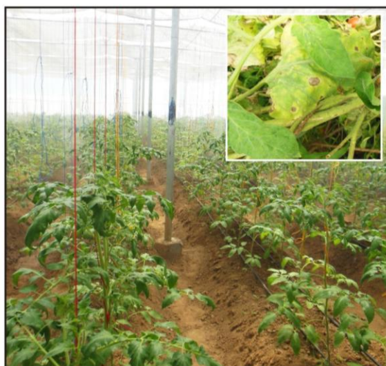
(E) Rajsamand (Tarsigada)