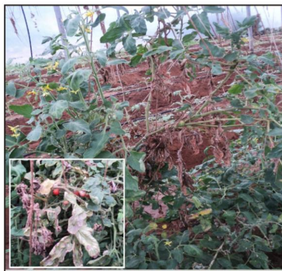
(D) Chittorgarh (Rajpura)