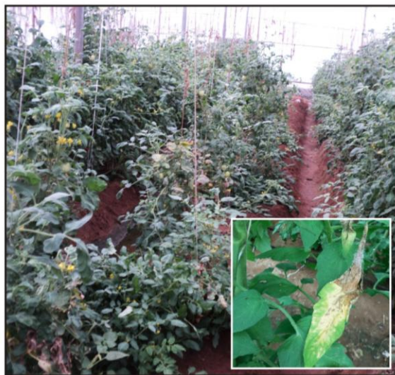
(A) Udaipur (RCA)