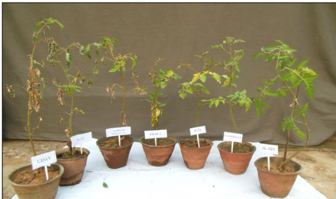
Figure 3 Group view of seven tomato cultivars showing different level of disease severity