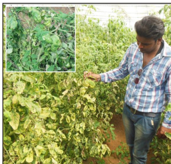
(F) Rajsamand (Nandoli)