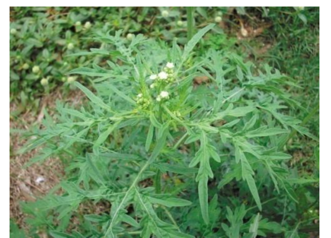
Figure 2 Selected weed (parthenium species)