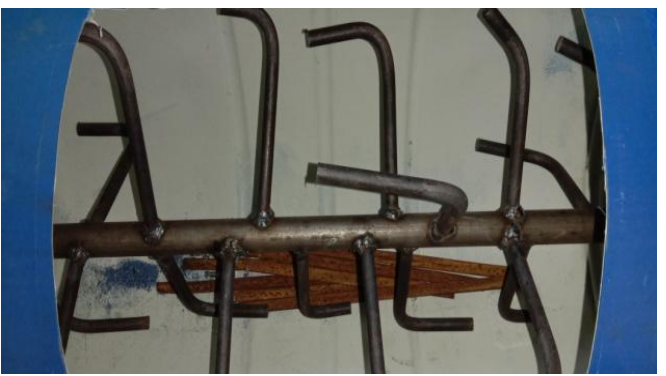
Figure 1 Agitated bed system

The selected composting materials based on the characterization with high moisture and high carbon content especially, saw dust carbon ratio will be 32.5:1. For better compost, C:N ratios ranges from 25-30:1. In view of enhancing the treatment of agricultural weeds in the developed in-vessel composter, the weeds (10%), saw dust (5%) and cattle manure (2-3%) are filled inside the composting cylinder in a layered manner one after another. The first layer is saw dust, second layer is cattle manure, third layer is saw dust, fourth layer is cattle manure and so on till it covers one-half of the volume of composter. After that the top layer which is the final layer is filled with the selected agricultural weeds to cover upto three-fourth of the volume of composter [7].