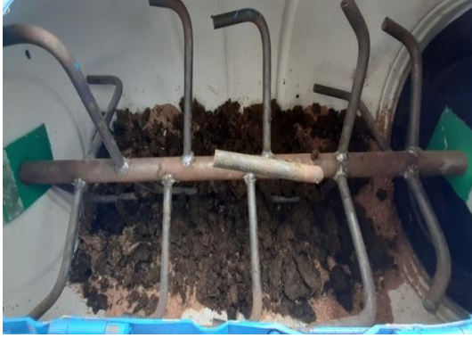
Cattle manure filling (2-5%)