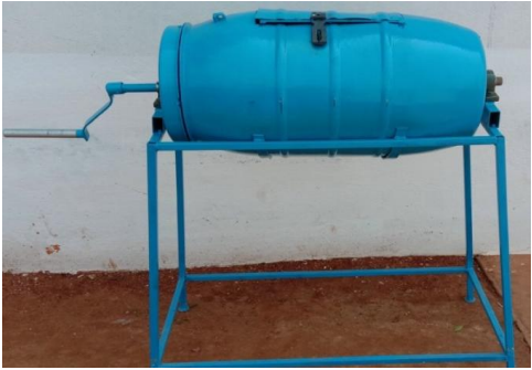
Agricultural weeds filling (10%) Fabricated in-vessel composter Figure 5 Feeding of composting materials and fabricated in-vessel composter