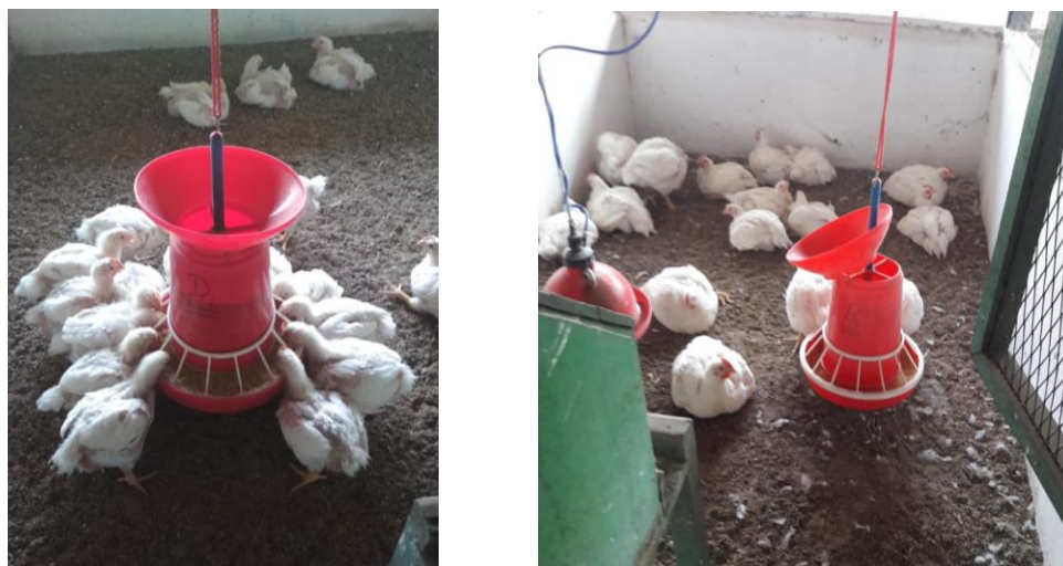
Figure 1 Experimental birds during starter and finisher phases

During this study, attempts were made to calculate the economics of broiler production under different treatment groups. The economics of broiler production was worked out by considering the prevailing prices of inputs and sale price of broilers in local market. All other cost components of production i.e. cost of chick, medicines, vaccine and other overhead were taken as constant for all the treatment groups. Gross profit per bird was calculated by subtracting the cost of production per bird from the price fetched per bird after selling it in the local market on live weight basis.