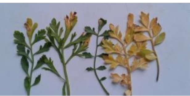
Different level of Aternaria alternata infection on Asalio leaves