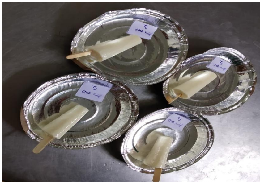
Figure 2 Camel milk powder supplemented kulfi (Control T 0 , T 1 , T 2 and T 3 )

The colour and appearance score of camel milk powder of the mean value of T 0 , T 1 , T 2 and T 3 was found to be 7.52, 7.52, 7.56 and 7.28 respectively. The highest mean colour and appearance score was recorded in T 2 and lowest was in T 3 .