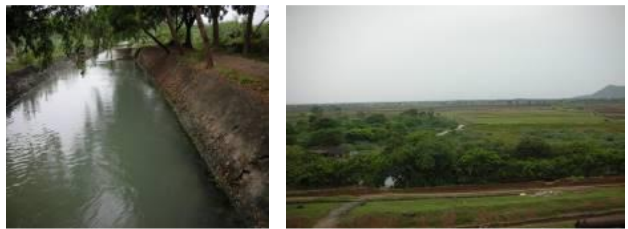
Figure 3 Decanted Water from Ash pond being used for Irrigation

It is essential that in an industrial area like thermal power plants, regular monitoring of water sources is needed, because they are surrounded by villages and hence can affect the health of local biota [13, 14].