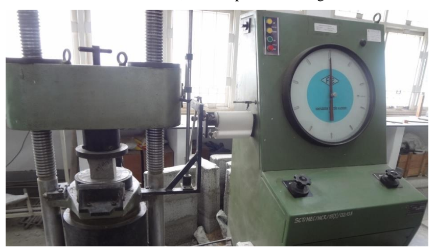
Figure 1 Cube Test on Compression Testing Machine

strength also increases. For a molarity of 16 M, specimens with 10% GGBS produces a compressive strength of 58.11 MPa whereas for the same molarity specimens with 40% GGBS produces a compressive strength of 82.28 MPa. This clearly reveals that as the content of GGBS increases, the compressive strength also increases.