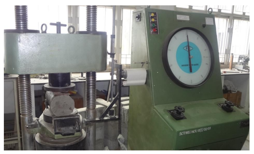
Figure 3 Split Tensile Test on Compression Testing Machine