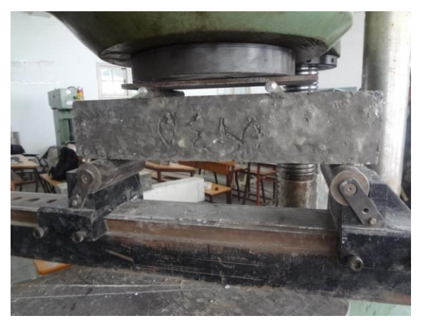
Figure 5 Testing of flexure Beam